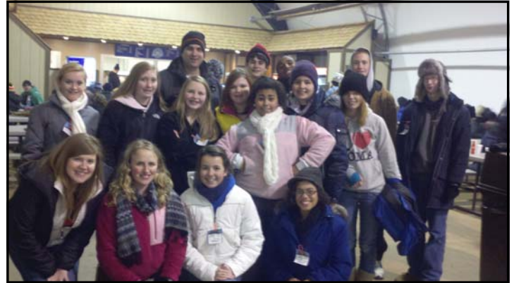
Youth ski trip to Perfect North on January 15, 2012